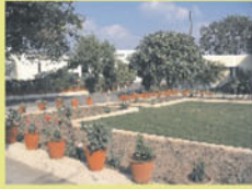
Amsar Indore factory

Amsar Private Limited, India's first recognized private sector R & D facility began investigating Ayurveda on modern terms, applying modern scientific processes to traditional claims.